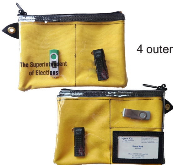
Multi-pocket Data Key Bag

4 outer pockets with clear side to see into pockets to easily know if data keys are inside without having to open the bag. Inner compartment within the fabric cannot be seen from outside.