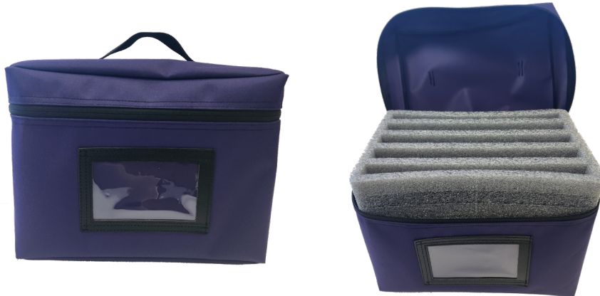
Flip-Top Keyless Security™ Bag with Foam Inserts

If you have a unique problem for catching, collecting, transporting, and storing ballots or election equipment/machines - call us today! We are eager to work with you to find the best solution for you!